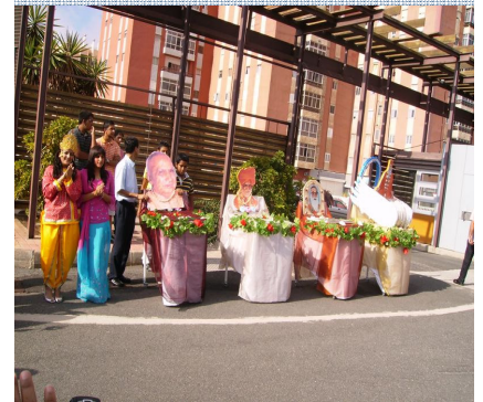
The mandals prepared by premis in order to welcome Satguru

This truly was a day to remember for all Premis.