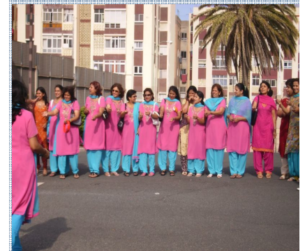
Premis dressed in identical attire anxiously awaiting Saijin's arrival